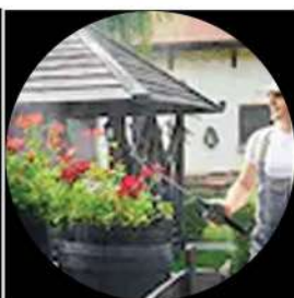
Collect the leaves in the bag