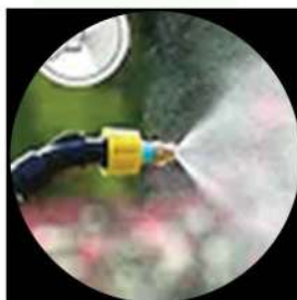
Gather the leaves together